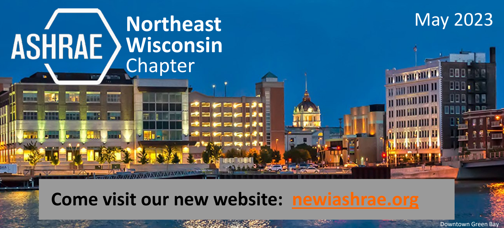
Downtown Green Bay

Come visit our new website: newiashrae.org