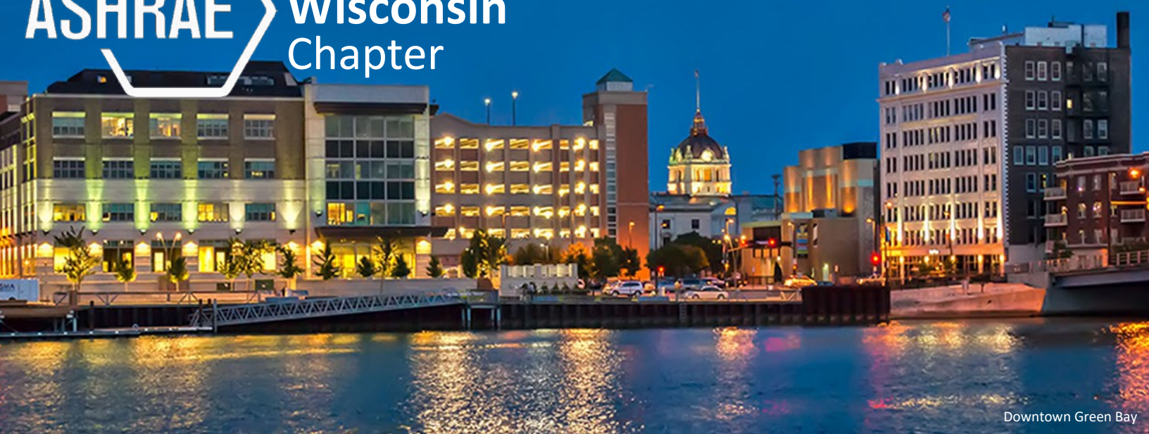
Downtown Green Bay